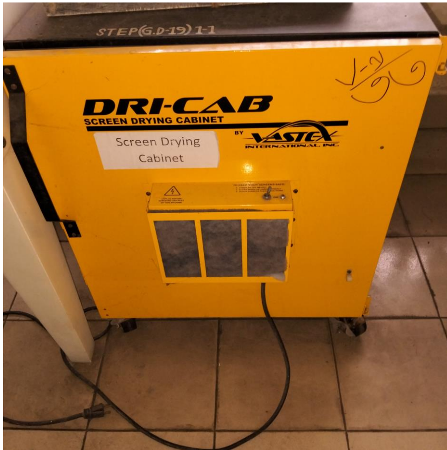
Screen Drying Cabinet