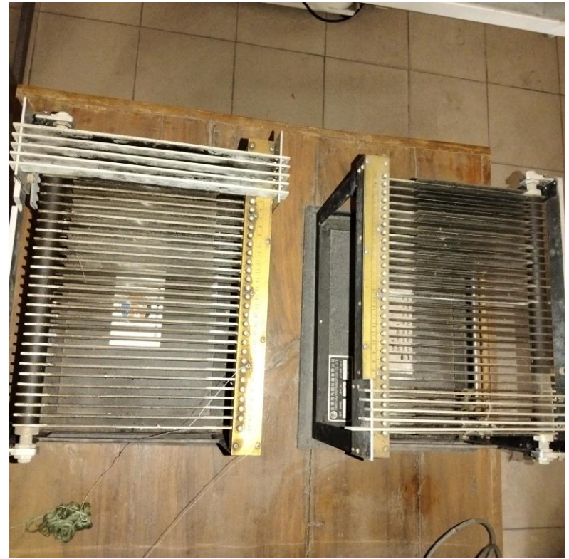
Shirley comb sorter