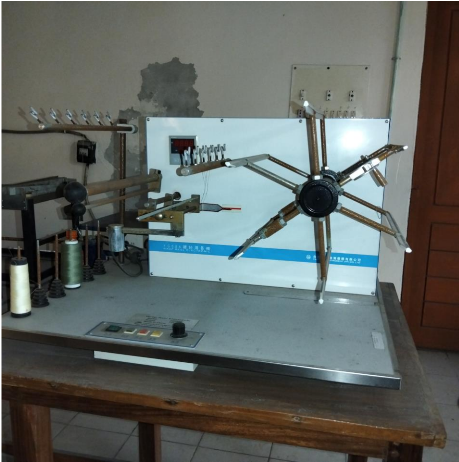
Wrap reel machine