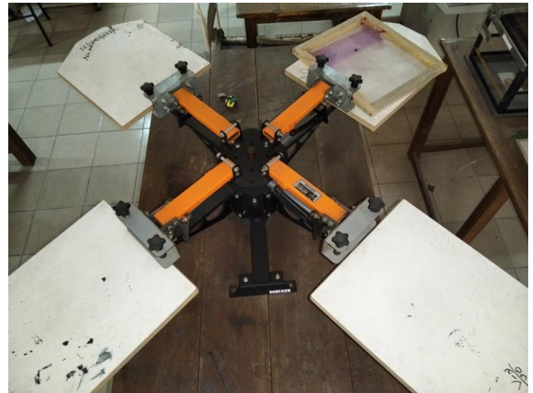
Four Color Four station Screen Press