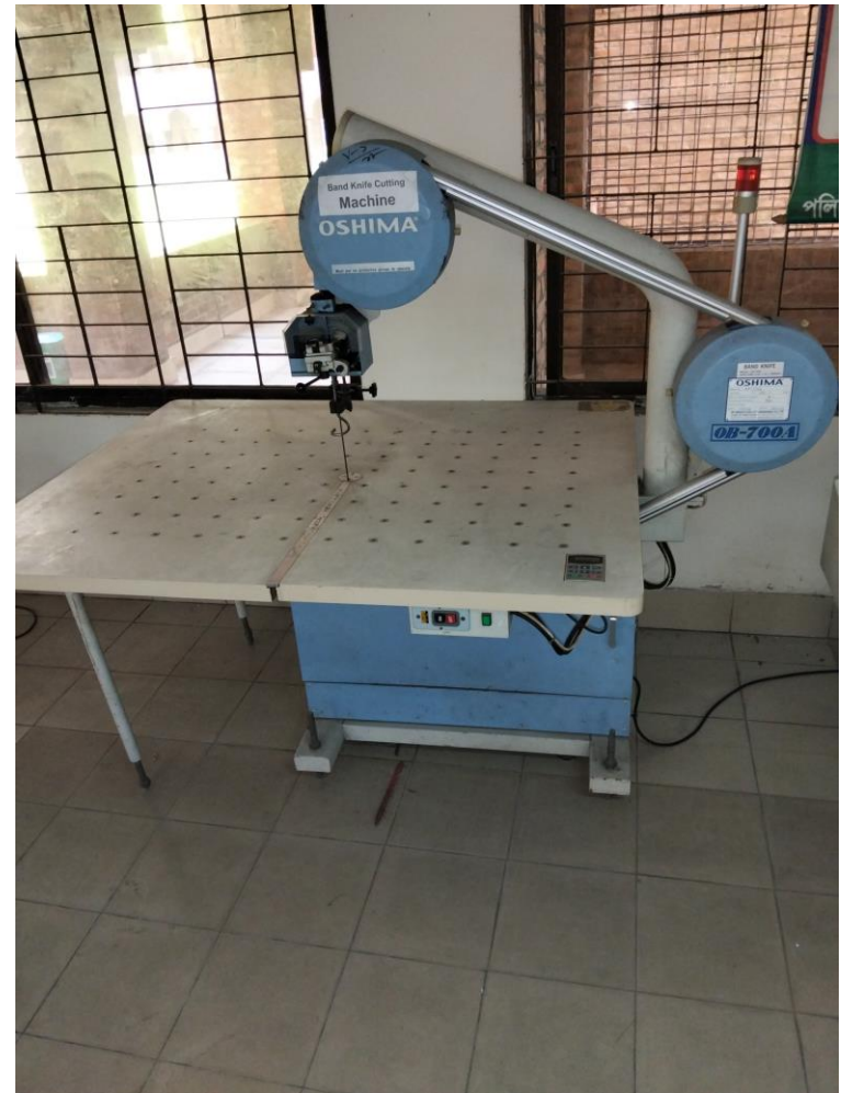
Bind knife cutting machine