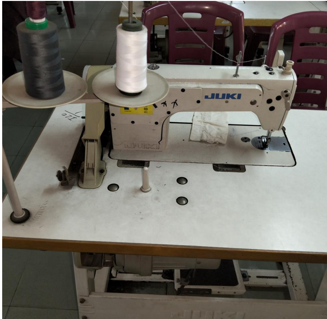
Lock Stitch Machine