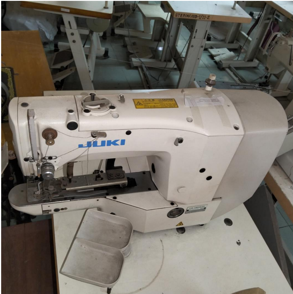
Button sewing machine