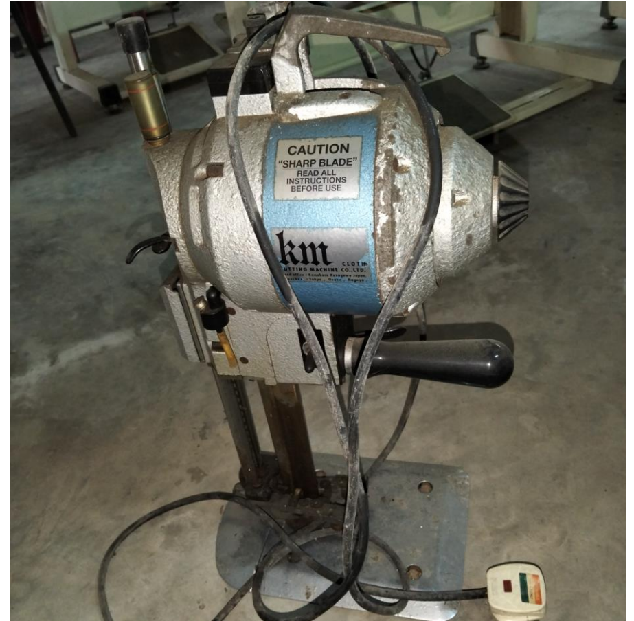
Straight Knife Cutting Machine