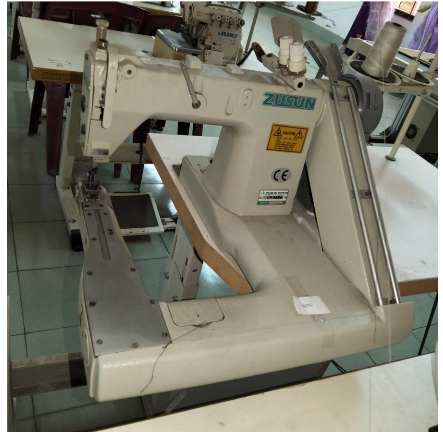
Feed of the arm machine