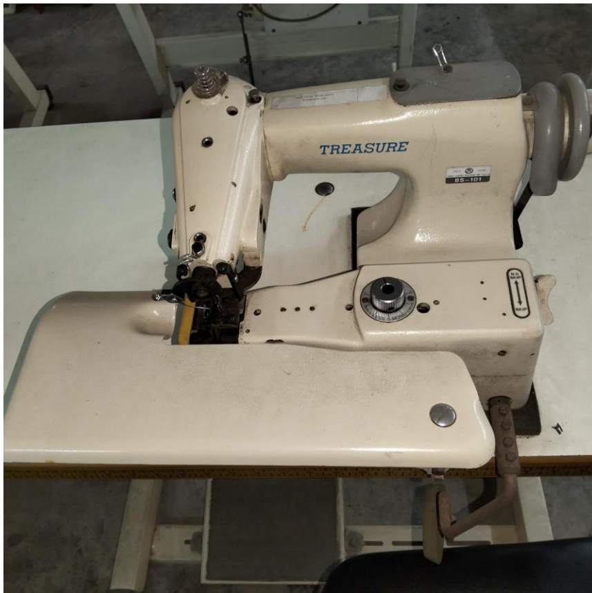
Blind stitch machine