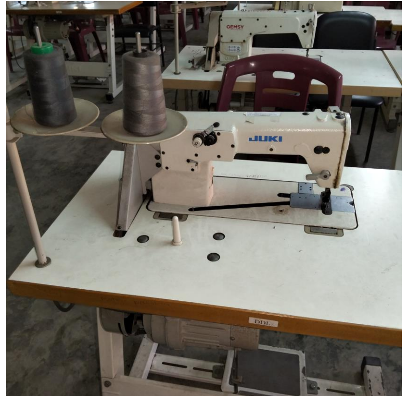
chain stitch machine